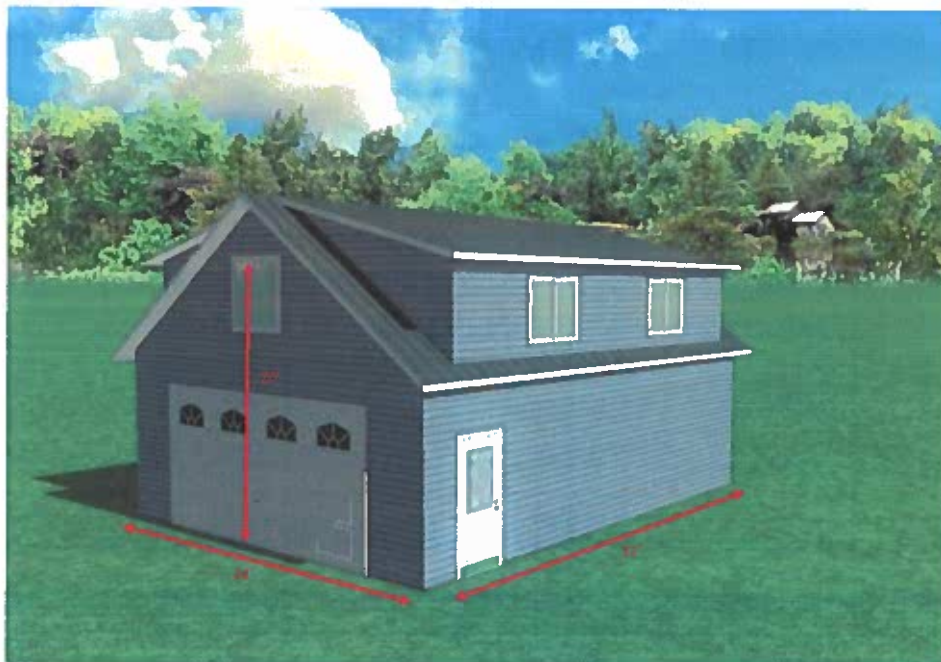
Proposed Garage: 24' x 32'